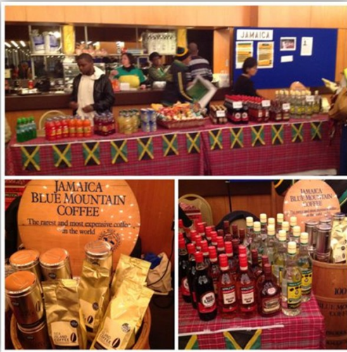
Jamaica's stall at the Commonwealth Fair 2013