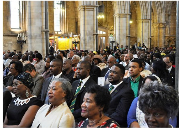
Jamaicans at the Independence Service