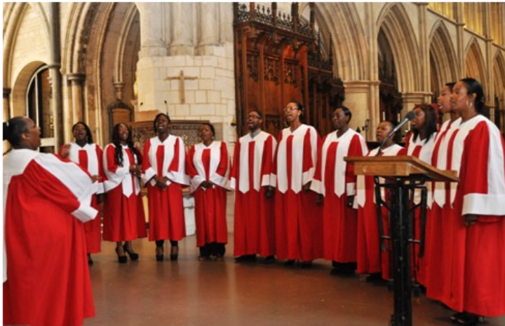
The British Heart Foundation Gospel Choir