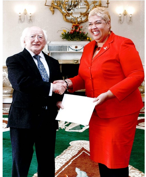
High Commissioner presents Credentials to H.E. Mr. Michael D. Higgins, President of the Ireland