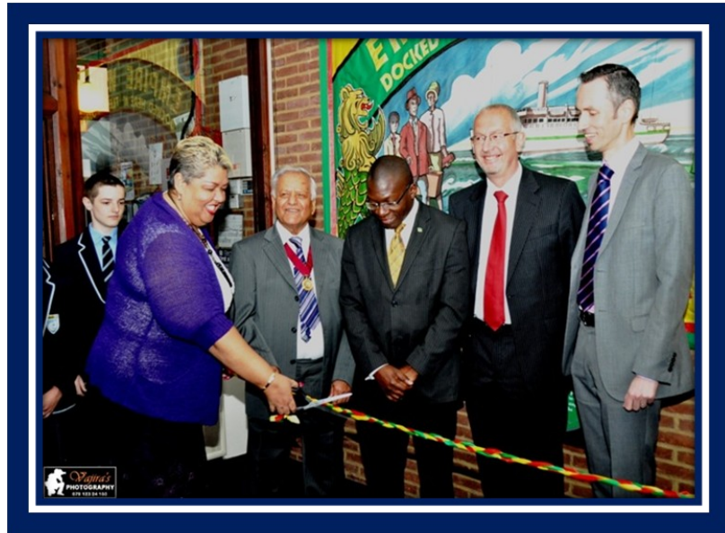
The High Commissioner with Representative of the Thurrock Council.

The exhibition was the first in a series of activities in Thurrock to commemorate the Windrush 65th Anniversary. The ship, which brought 492 Jamaicans and other West Indians, signalled the first wave of mass Caribbean migration to the United Kingdom (UK).