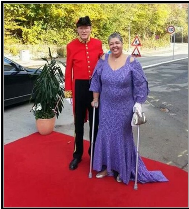
HC Ndobet-Assamba after presenting Credentials in Denmark and Finland