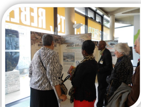
H.E. Aloun Ndobet-Assamba, High Commissioner and other Guests view a section of the Exhibition

High Commissioner Her Excellency, Aloun Ndobet-Assamba, opened an exhibition at the Royal Geographical Society in London on Tuesday, November 5, marking the 175 th Anniver-