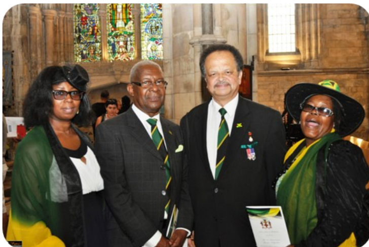
A group of patriotic Jamaicans