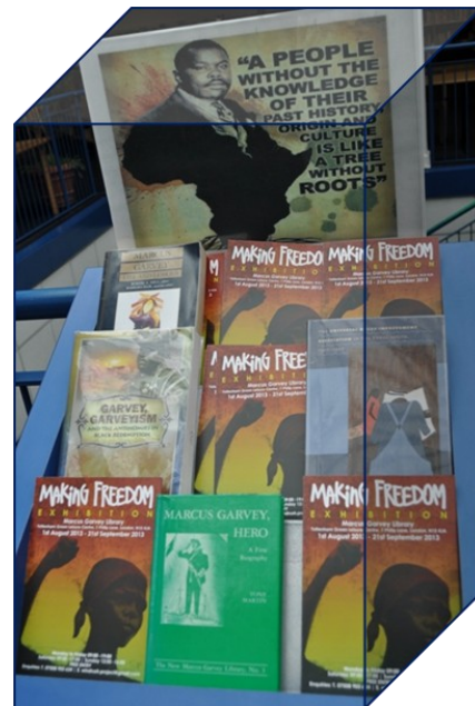
Above: Books on display at the Marcus Garvey Tribute